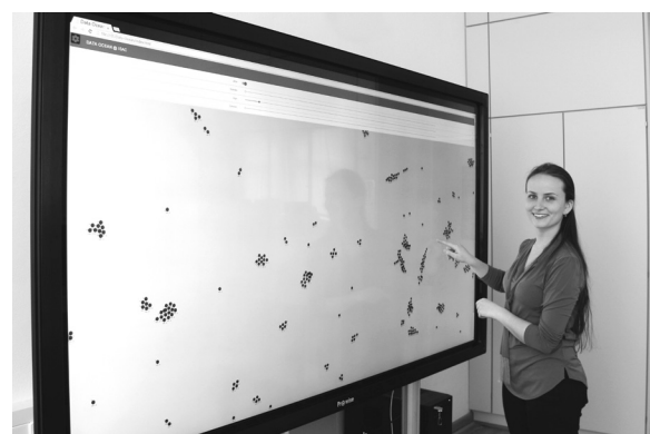
Figure 3. Human Machine Interface: Using DataOcean@ISAC on an 84” touch wall

Furthermore, a performance optimization of the DataOcean@ISAC visualization algorithm will be strived. The actual algorithm is limited to managing several thousand data objects, depending on the used hardware. The number of presentable particles has to be enhanced in order to use the visualization with big data structures. The use of JavaScript visualization runtime is browser based and adaptive to any display size. Therefore, the enhancement of the performance will guarantee proper usage of inefficient devices like tablets or smartphones in comparison to powerful PCs, touch tables or big touch walls. Figure 3 depicts an early version of the DataOcean@ISAC framework used on an 84” touch wall, which can be used in an authentic facility environment and is able to display big amounts of data.