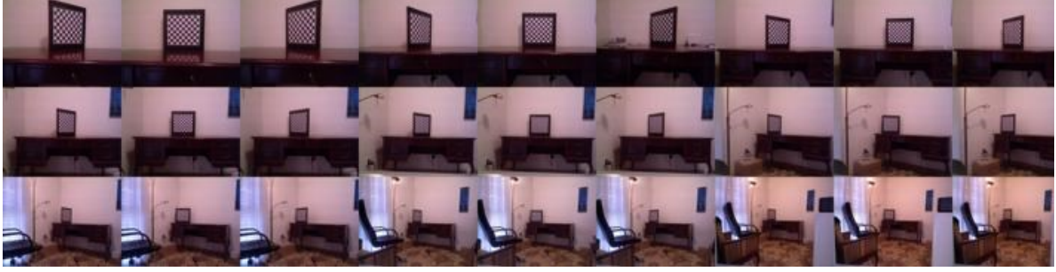
Figure 2. Calibration images

of homogeneous 3D coordinates from RGB to IR camera frame.