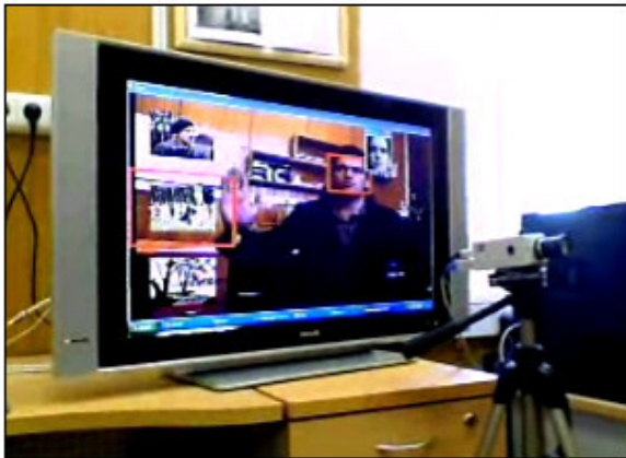
Figure 4. Intuitive interaction system “Person – TV set”.

The development of method with the use of additional information sources is planned later on. Such systems may additionally use algorithms, based on audio or infrared sensors.