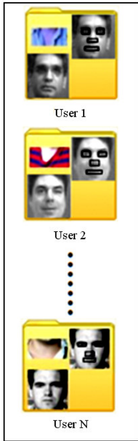
Figure 2. The database of users.

system. Figure 2 depicts the database, holding necessary information for recognition algorithms.