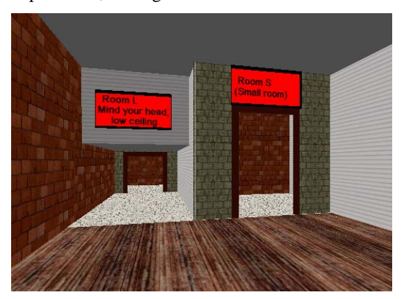
Figure 3: The environment for the "Environment Layout" experiment

In order to investigate how such environmental factors might affect PSI in a virtual world, 8 participants were "invaded" in differently already designed rooms (and also "outdoors") within a CVE and subsequently interviewed about their experiences, see Figure 3 for the virtual rooms.