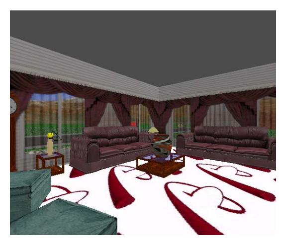
Figure 1: A room in the virtual environment where invasion occurred

The avatar gender experiment involved 40 participants, each of whom had their avatar's personal space "invaded" by the avatar of a further participant - a "confederate" - who was acting under instructions from the researchers. The invasions took place in an already built virtual environment using ActiveWorlds; see Figure 1 for a room in this environment.