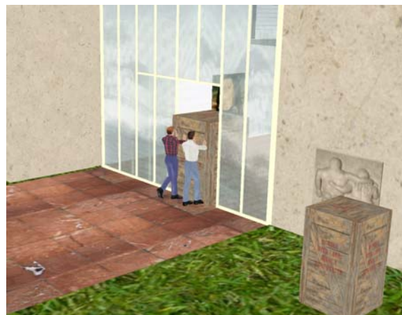
Figure 3 Two agents pushing the large crate

We are asking the agent Gino to form a plan to get the big box to the lobby and afterwards to execute it (see Figure 2b). The plan tells the agent to get somebody to help. “SELF” is the agent which submitted the planning request and “TEAMMATE1” is a collaborating agent asked to help. During the execution of the plan the originating agent (team leader) will negotiate the team formation and when successful, it will substitute the real name of a team member for “TEAMMATE1”. The next step consists of moving the teammate from his current position to the front yard, where the crates are. “Anywhere” denotes a special place, from which it is possible to go everywhere. The team leader does not care where the teammate is at the moment, but it needs to establish him into a known state (and move him to the necessary place). The operation “DECLARE-DOOR-PASSABLE” is a helper operation which declares the two places on the sides of the door as connected in case that the door is open. The remaining two steps are self-explanatory. The resulting action after executing the associated animation script from the smart object is depicted in Figure 3.