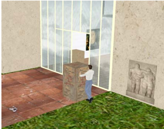
Figure 4 Gino pushing the small crate

For the small crate, the resulting plan is simpler since the agent can immediately perform the needed action – Figure 2a. The animation performed by the associated animation script is shown in Figure 4.