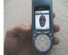
Figure 4. Mobile phone with the image general with our system

In the figure 4, we can see a mobile phone with the image general with our system, is similar in size to one SMS and with a MMS we can send also the texture. In any case, after the initial process only we need to send the changing points in animation. We are working hard to define a application in Java specially dedicate to mobile requirements to using the owns mobile camera we can do all the process.