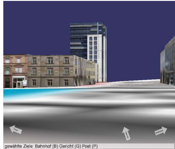
Figure 2. Walkthrough with POI

To visualize the walkthrough DaMaViS includes a viewer application based on the Open Scene Graph graphics toolkit. The original OSG viewer has been augmented with the ability to display all given points of interest (Figure 2). Therefore easy navigation to all interesting points of the walkthrough is provided.