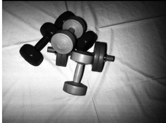
Figure 1: Intensity image of the scene

it appeared reasonable to use a median filter with a 15 \times 15 operator window. The drawback is that we lose a high amount of range information so that the spatial relation of the extracted features is inconsistent in many cases.