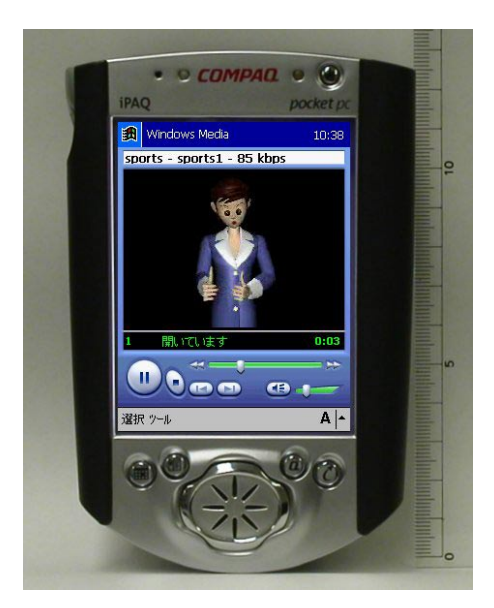
Figure 4. Sign language animation displayed on PDA.