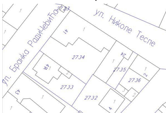
Figure 2. A sample from a vectorized cadastral map from the time of Mary Theresa (corresponding to the map in Figure 1)

There are many studies that deal with map vectorization [Boa92], [III91], [Con97], but the first that attempts to use neural networks to solve the complex problem of the digitization of Chinese cadastral maps and automatic extraction of high-level information was done by Chen et al. in 1996 [Che96]. The system they had developed at the time, consisted of three main parts: the separation of text and graphics, extraction of parcels and recognition of rotated characters. Even though the text and graphic separation and parcels extraction was not done by machine learning methods, they were among the first ones to propose a neural network approach to the recognition of Chinese hand-written and rotated characters. The used neural network was a two-dimensional Hopfield neural network [Hop82] which was able to reflect the degree of similarity of the test characters to previously stored templates in the final states of neurons.