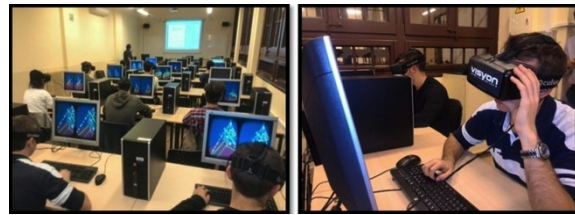
Figure 2. VR sessions.