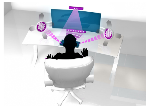
Figure 1: Illustration of the presented acoustical interface, generating sound zones.

In this work we propose a new audio user interface for communication means, applicable in both home and office environments. The aim is to eliminate ergonomic