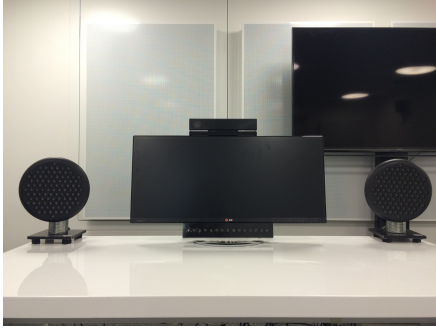
Figure 2: Hardware prototype of the presented acoustic interface, consisting of the Kinect 2 depth sensor, a 13 channel microphone array, and two parametric arrays mounted on automatic alignment units.

directional sound reproducing system and a microphone array. Figure 2 shows the resulting hardware prototype. By using such techniques in communication systems or gaming applications, the immersion of the user is supported. In a professional environment such a system can be applied to provide cognitive relief, reduce stress, and increase mobility while reducing the overall noise level, or simply improve ergonomic aspects by freeing the user of a worn headset.