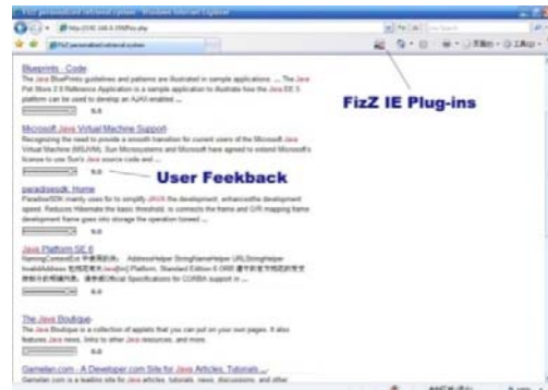
Fig. 3 Retrieval result page of FizZ

interest communities. By user feedback, we could evaluate whether retrieval results accord with the user interest.