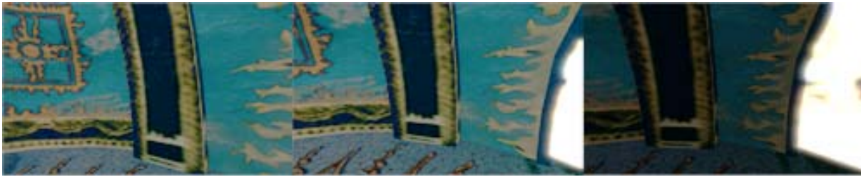
Figure 1: Bloom effect

of the previous section. First the scene is rendered into a floating point buffer. In this buffer the pixels with high intensities represents the glowing parts of the scene. We use a low pass filter to separate these parts to another image buffer. The second step is to blur this image using convolution with Gaussian kernel. After the blurring pass the original image is combined with the generated glow image pixel by pixel. To get good results, we need to use high dynamic range source image, otherwise we may catch too much or too less “glowing emitter” part of the image.