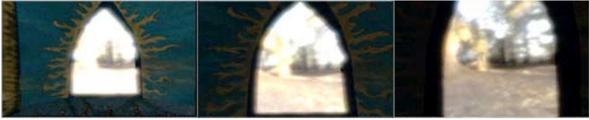
Figure 2: The adaptation process