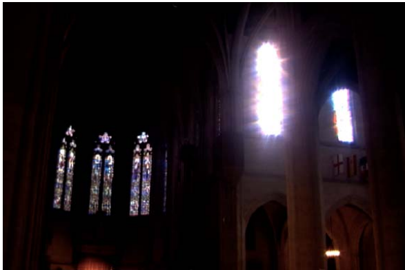
Figure 4: Original image without tone mapping