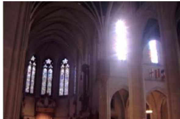
Figure 6: Tone mapping with bright light conditions