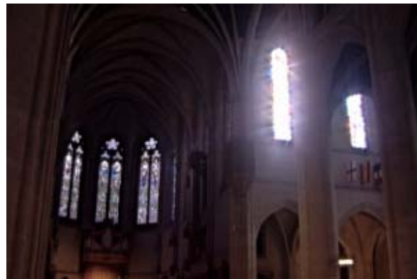
Figure 5: Tone mapping with normal light conditions