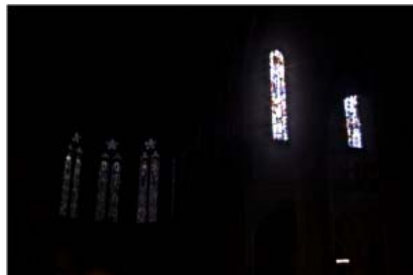
Figure 7: Tone mapping with low light conditions