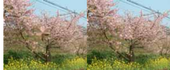
(c) CSRBF (d) Our Combination Approach