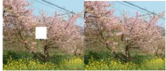
(a) Original Japanese cherry tree (b) Bertalmio M.

Fig. 2 shows the inpainting results for damaged Japanese cherry tree in which the boundary color of damaged area change more remarkably as compared with Lena photograph depicted above. The original Japanese cherry tree image in which the damaged area is approximately identical to Lena in size is shown in Fig. 2(a). Fig.2 (b) and (c) show the reconstructed results on basis of iterative gradient interpolation algorithm proposed by Bertalmio M. and CSRBF respectively. Although they can be well adapted to above Lena image, both fail to reconstruct damaged Japanese cherry tree image. As the reason, it can be regarded as that the boundary color surrounding the damaged area changes significantly and the size of damaged area becomes broader. In contrast, the proposed combination reconstruction results in one desirable image which nearly exhibits damaged mark as shown in Fig.2(d). In addition, third-level wavelet transform is employed in the duration of decomposition. That is to say, the shaper boundary of damaged area leads to much more decomposition times in order to make the CSRBF available.