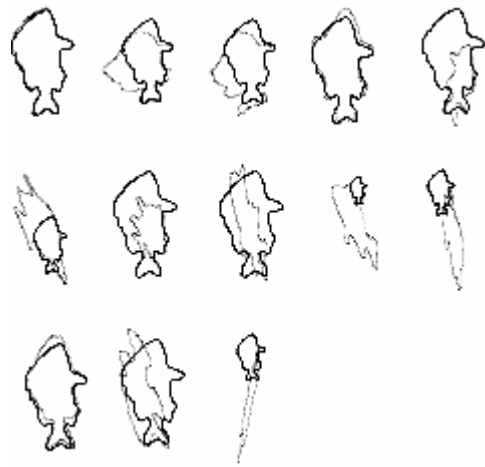
Figure 2. The alignment of contour of fish 0 th (dark contour) against thirteen contours of fish (light contour) using feature f1 and five-point coplanar invariance

To demonstrate the capabilities of the shape matching exploiting a set of geometric invariance curve, we applied the algorithm for shape classification thirteen contours of fish which have the various patterns. Each contour has approximately 400 points of coordinates. The third order B-Spline with control points of 30 is employed to fit the contours of fish. To find the fish which matches with the 0 th fish, a feature point f1 is determined. Figure 2 shows the results of shape alignment