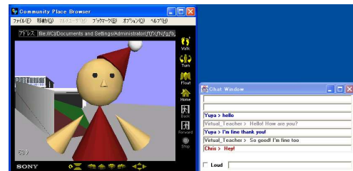
Figure 1: Main and chat frames

In the Orbis , a client-server model synchronization of avatar information enables users to share a virtual environment. Autonomous characters, behaving as an avatar without the actual user, is recognized as a client at the Orbis server; implemented with the same protocol as an ordinary client. Prototype of autonomous characters only do autonomous walk and tiny conversation. The text chat function is implemented with a Java frame component (Figure 1), and synchronizes the chat messages with a client-server model.