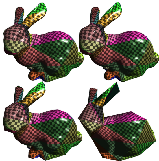
Figure 2: Bunny with 16000(u.l), 2000 (u.r), 500 (b.l.) and 50 (b.r.) triangles

The algorithm in Section 3 has been applied to several meshes to prove it. Every domain mesh could be mapped to the original mesh without problems and produced smooth parameterizations. Together with these parameter spaces we produced textured multi-resolution models. Figure 2 shows the parameterized “Stanford Bunny” in different approximations. The checker-box texture shows the smoothness of the parameterization, while the colors indicate the different domain triangles.