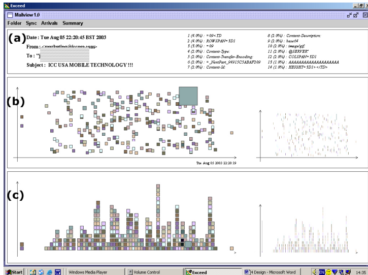
Figure 1 A screenshot of Mailview, depicting emails from the spam directory from our personal email archive.