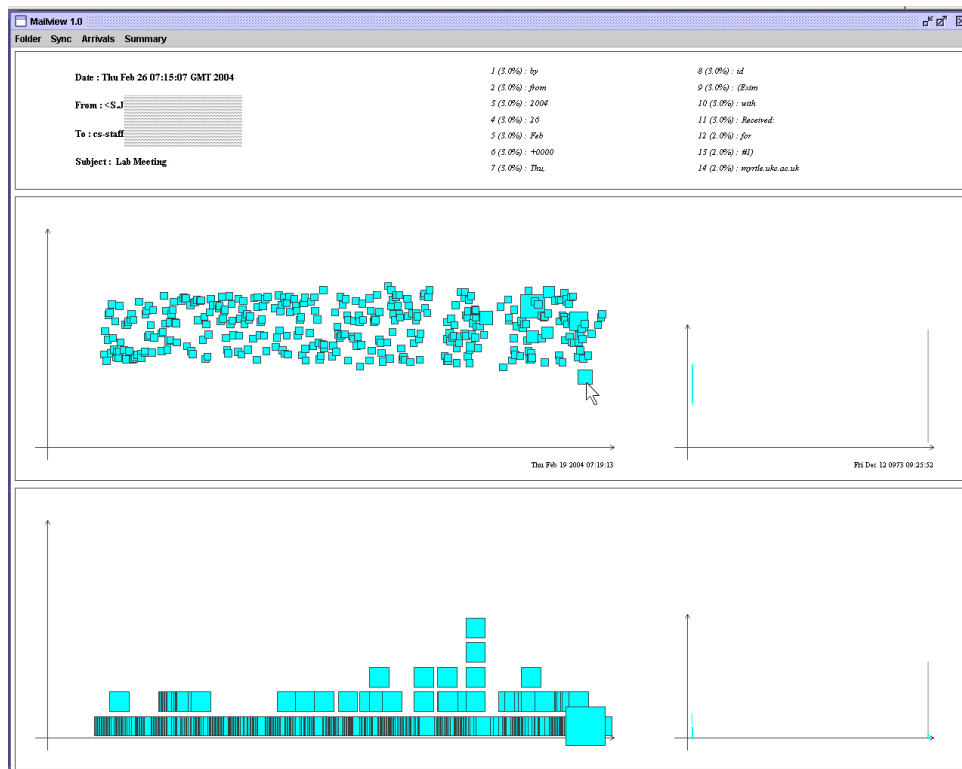
Figure 3 This screenshot shows Mailview displaying emails of laboratory meetings. After a quick observation it is easy to see that most of the emails have arrived during traditional work hours (8.30am to 5.30pm).