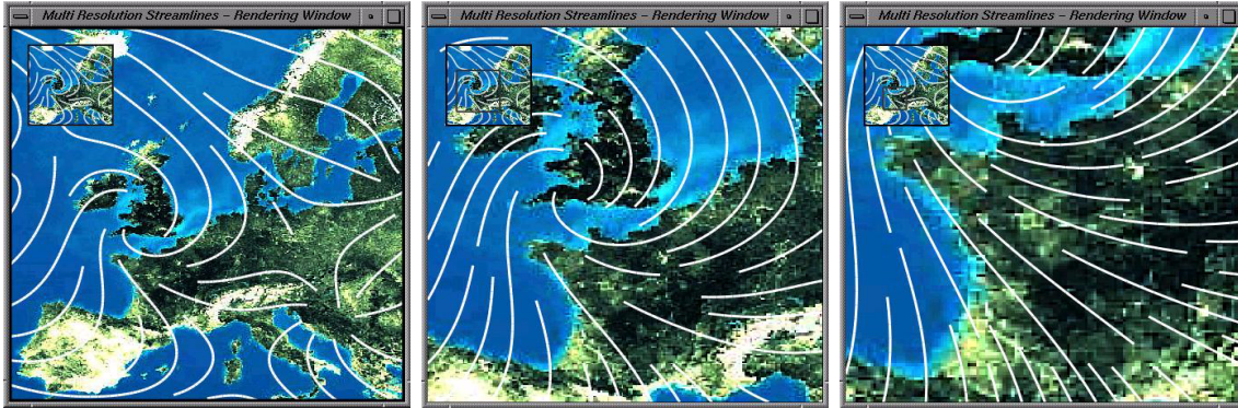
Figure 2: Three snapshots of an interactive exploration of a vector field using our multiresolution viewer. The suitable level of the hierarchy is selected at any time to maintain a roughly constant density of streamlines.

disturb the observer. In [4] we have proposed such kind of mechanism for handling the apparition and disappearance of streamlines in the context of visualization of time-varying vector fields.